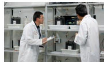
Prototype development and evaluation

To ensure the quality and superior performance of our batteries, Trojan applies the most rigorous testing procedures in the industry to test for cycle life, capacity, charger algorithms and both physical and mechanical integrity. Trojan's battery testing procedures adhere to both BCI and IEC test standards. Trojan's state-of-the-art R&D facilities include charger characterization and analytical labs, battery prototype and evaluation labs and battery autopsy centers all dedicated to providing you with a superior battery that you can rely on.